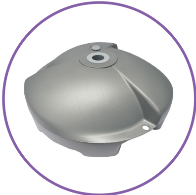
QTY 1 Base